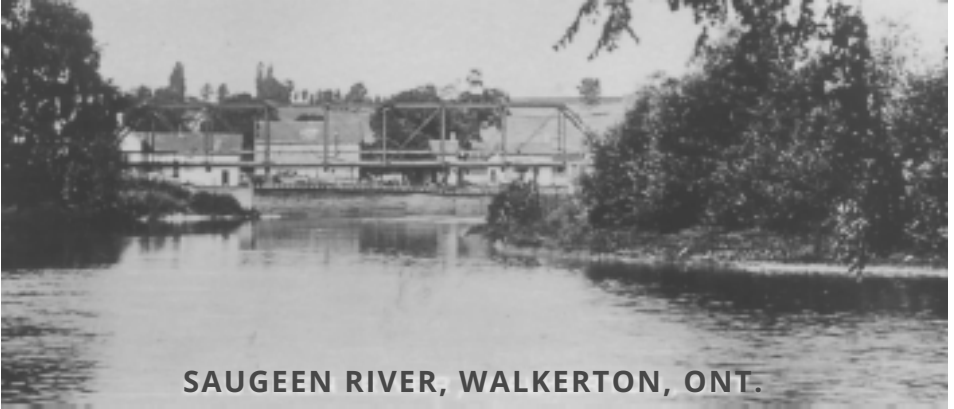
SAUGEEN RIVER, WALKERTON, ONT.

The Municipality of Brockton was incorporated in 1999 when the former Township of Brant, Township of Greenock, and Town of Walkerton were amalgamated. The name Brockton was chosen as a combination of these names. Settlers arrived to the area around 1850 and faced many hardships to obtain land grants from the Crown. Since then, Brockton has continued to grow and flourish.